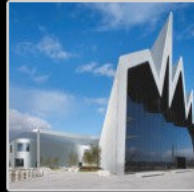
Glasgow Riverside Museum: Helène Binet