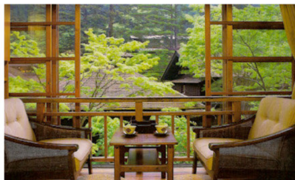
Onsens , or hot spring resorts have been popular for centuries in Japan, and continue to attract modern Japanese, as well as visitors from abroad. The above photo, Hoshi Onsen in Niihara, Gunma Prefecture shows the view from a guest room looking through trees to the Hoshi-no-yu bathhouse. The onsen was built in 1875 and stands alone in a national park among the mountains of Gunma, northwest of Tokyo.