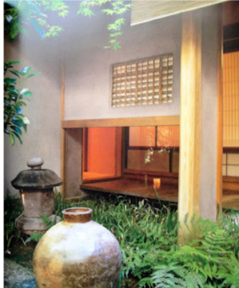
The Japanese inn Tawaraya in Kyoto has a history dating back 300 years, and counts among its guests James Michener, Rudolf Nureyev, Pierre Trudeau, Marlon Brando, Betty Ford, Jean-Paul Sartre, Leonard Bernstein, Simone de Beauvoir, Alfred Hitchcock and John D Rockefeller IV. The inn's street entrance is so small one can walk past it without noticing. There is no lobby, just a small reading room, some nooks to sit and relax in, corridors with flowers, and then the rooms, all looking out on a private corner of a perfectly tended garden. It represents classic hospitality compressed into eighteen rooms situated in the heart of busy modern Kyoto. The photograph shows a stone lantern ( ishi-doro ) and a tamba ware pot in a corner of the garden. In back is the engawa or veranda outside one of the rooms.