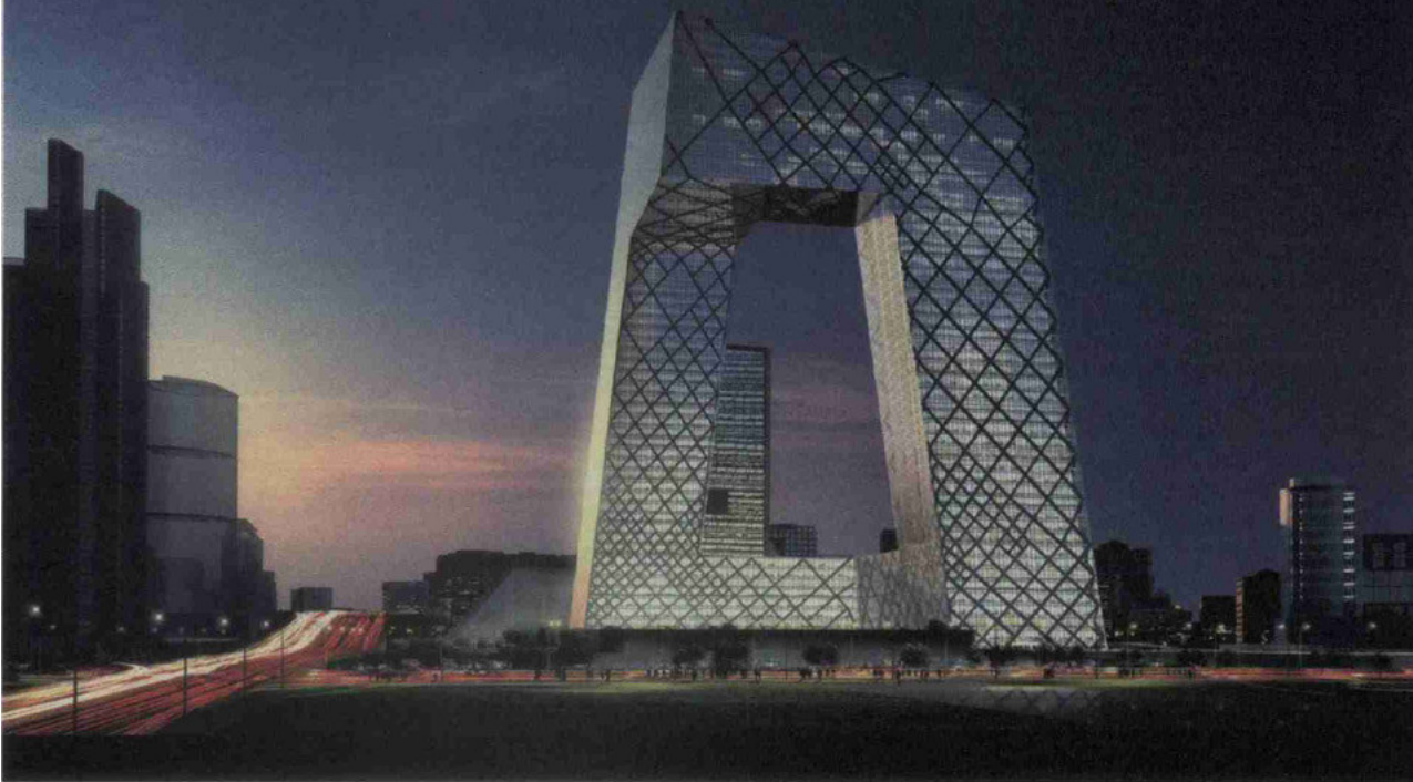
A rendering of the China Central Television Headquarters in Beijing, designed by Rem Koolhaas's architecture firm, OMA, in partnership with the engineering firm Arup. Begun in 2004, the building is now largely completed but has yet to be occupied.