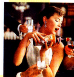
Advertising & Lifestyle: Continued Culture in mid-century America MARTINI ROSSO