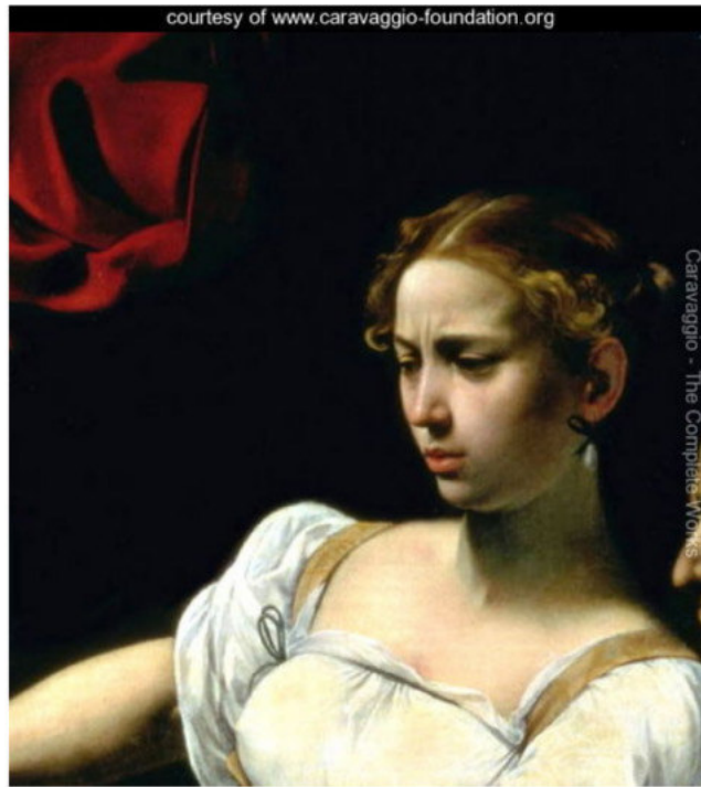
Caravaggio: The Complete Works – Hardcover: 306 pages. Publisher: TASCHEN America Llc (December 1, 2009) Language: English, ISBN-10: 383650183X, ISBN-13: 978-3836501835, Product Dimensions: 19 x 13 x 2.2 inches