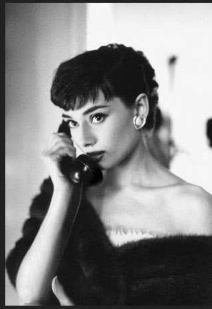
Audrey poses with a phone during a 1953 photo session at Paramount Studios

Bob Willoughby, a distinguished Hollywood photographer who took iconic photos of Marilyn Monroe and Elizabeth Taylor, was called in to shoot Audrey Hepburn in the beginning of her career and she caused a lasting impression, becoming his favourite subject.