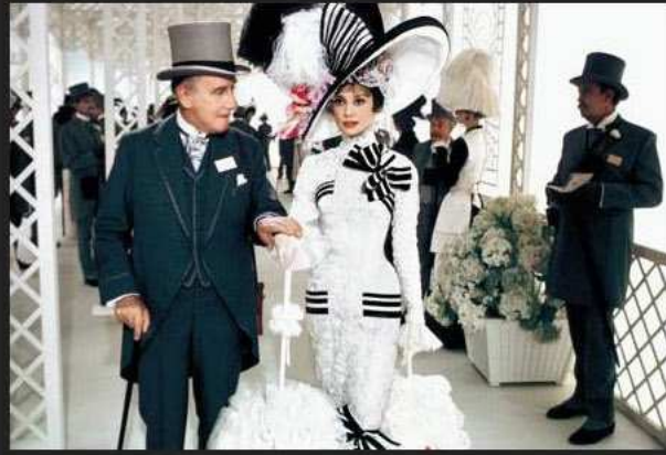
Eliza is escorted by Colonel Pickering, played by Wilfrid Hyde-White, on a day at the races at Ascot

Audrey Hepburn lives on as an elegant and mesmerising woman who has seduced us with her talent in iconic movies from Hollywood's golden age.