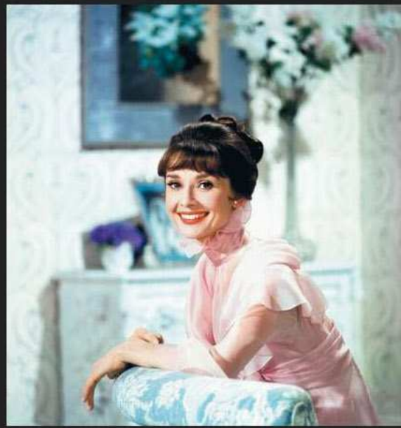
My Fair Lady : Eliza meets Higgins's mother, who is completely on her side

profoundly disadvantaged communities in Africa, South America and Asia. Her passion for humanitarian work was recognised one year before she died of appendiceal cancer at her home in Switzerland in 1993.