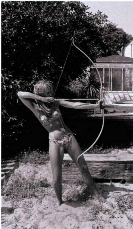
Jane Fonda, Malibu, 1965