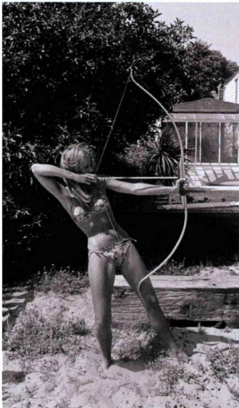
Jane Fonda, Malibu, 1965