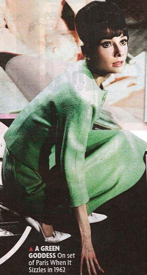
▶ A GREEN GODDESS On set of Paris When It Sizzles in 1962