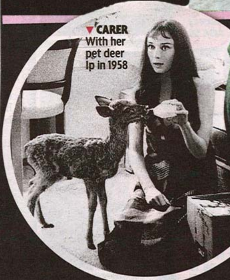
▼ CARER With her pet deer Ip in 1958