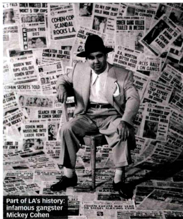
Part of LA's history: infamous gangster Mickey Cohen

The glitter and grime of today's sprawling Los Angeles metropolis may hide it well, but just over 150 years ago the self-styled City of Angels was little more than a desert wasteland. This exquisite – and weighty – book charts the rapid changes that turned an ancient Native American settlement into the pop-culture lodestone of the western world. From the first known photograph of the city, to the vintage glamour of Hollywood's '50s heyday, to the '90s race riots, each phase of LA's development is exposed in fascinating stills, accompanied by an informative commentary.