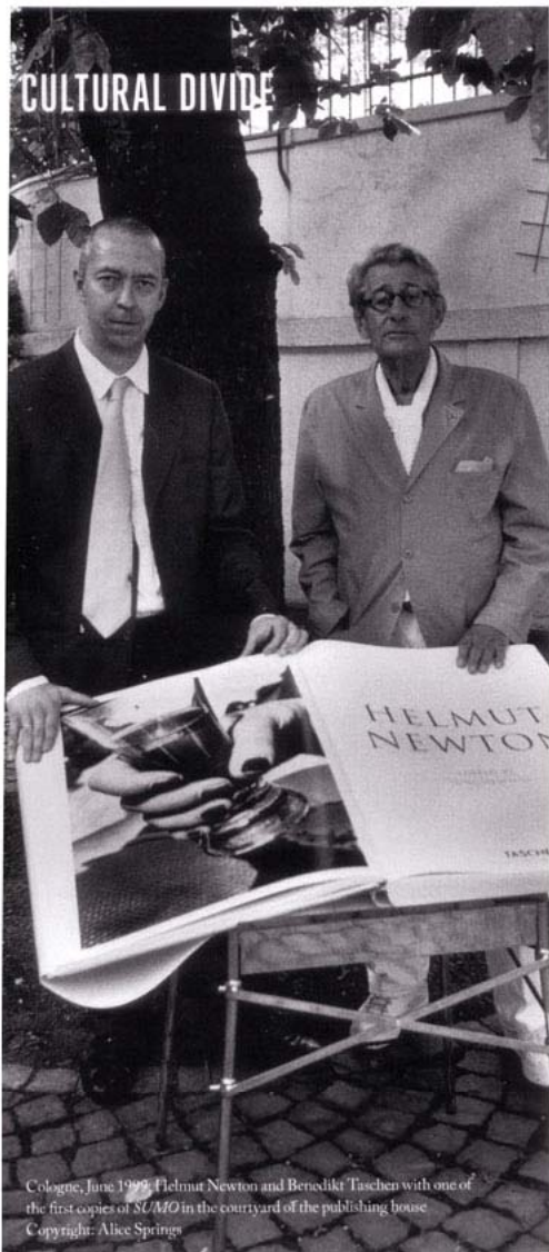
HELMUT NEWTON AND BENEDIKT TASCHEN IN THE COURTYARD OF THE PUBLISHING HOUSE WITH ONE OF THE FIRST COPIES OF SUMO