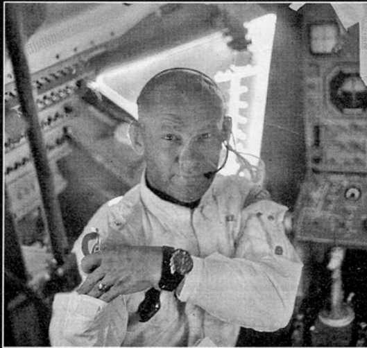
Lift-off: Buzz Aldrin (above) on Apollo 11; an iconic shot of Aldrin on the moon (right) with Neil Armstrong reflected in the visor; Armstrong on the moon with lunar landing vehicle in the background (below).