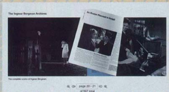
TASCHEN website's new feature: LEAF THROUGH! You can view the full book (592 pages) online.

Each book comes with an original film strip from a copy of Fanny and Alexander (1982) that has been played on Bergman's own film projector. The second bonus is a DVD containing over 110 minutes of new and rare documentary footage.