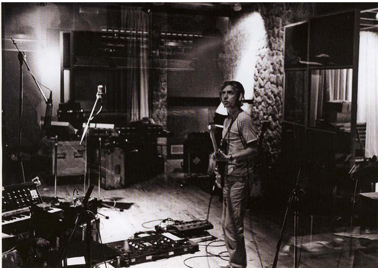
1981 Andy Summers: Self portrait in West Indies recording studio