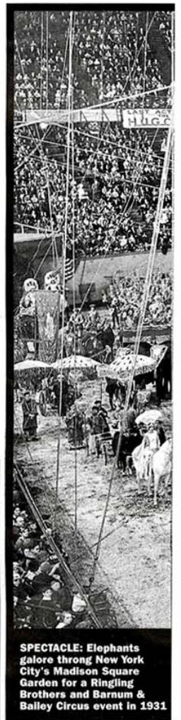
SPECTACLE: Elephants galore through New York City's Madison Square Garden for a Ringling Brothers and Barnum & Bailey Circus event in 1931