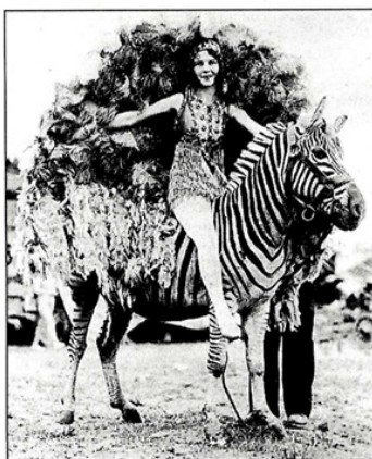
EXOTIC: Animals were often used in acts

on a platform as onlookers openly gawped and jeered. However the families of people with birth defects would often seek out circus proprietors, taking the view that their relatives were likely to experience less hardship and social exclusion as circus acts than if they tried to lead normal lives or were institutionalised. They also gained financial independence.