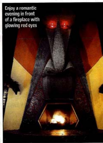
Enjoy a romantic evening in front of a fireplace with glowing red eyes