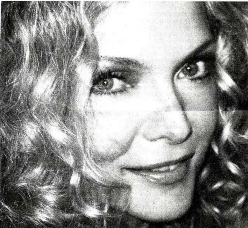
COME TO THE PARTY: (clockwise from top left) Gwyneth Paltrow, Stella McCartney and Tom Ford; David Beckham and Michelle Pfeiffer. From 'Let Me In' by Mario Testino (Taschen €31.99.) He's one of the most acclaimed and influential fashion photographers of the 21st century and this is his personal archive of backstage moments of some of the most glamorous people in the world. With a foreword by the very gorgeous Nicole Kidman.