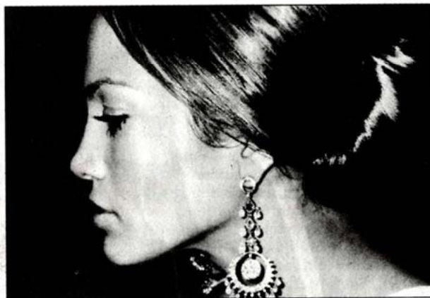
Star quality (clockwise from top): Gwyneth Paltrow pulls a face for the camera while Tom Ford and Stella McCartney gossip; Jennifer Lopez; Anjelica Huston and Matt Dillon.