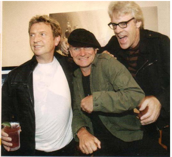
The reunited Police (from left, Andy Summers, Sting and Stewart Copeland)