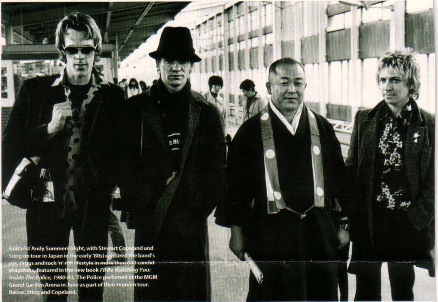
Guitarist Andy Summers (right, with Stewart Copeland and Sting on tour in Japan in the early '80s) captured the band's sex, drugs and rock 'n' roll lifestyle in more than 600 candid snapshots, featured in the new book I'll Be Watching You: Inside The Police, 1980-83 . The Police performed at the MGM Grand Garden Arena in June as part of their reunion tour. Below: Sting and Copeland.