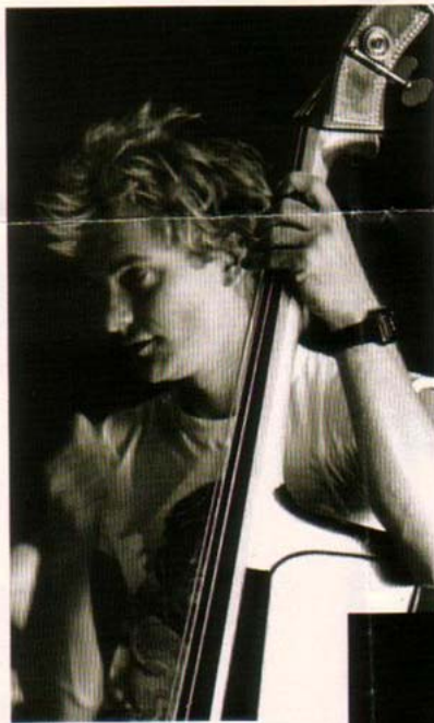
Andy Summers' exclusive photographs show the band at work and during candid moments as they tour the globe at the height of their fame.

of their first recording, 1977's "Fall Out." Sting and the boys will be together throughout the fall playing dates in Europe. The Police are also immortalized in a provocative new book, I'll Be Watching You: Inside The Police, 1980-83 (Taschen), which features behind-the-scenes photos of the band during their early fame. Guitarist Andy Summers recorded the band's sex, drugs and rock 'n' roll lifestyle from Australia to Mexico. I'll Be Watching You includes more than 600 exclusive photos of The Police at work and play (including snapshots of trashed hotel rooms and panting groupies). The night before their Sin City show, lensman Summers hosted an exhibit at the Revolution Lounge at the Mirage and signed copies of the tome. While times are less raucous for The Police today, they can be content counting the cash this record-breaking tour has generated. Synchronicity, indeed. ♠