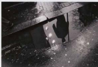
► Shadow Puddle, London February 2004

In the foreword to the exhibition catalogue, David Bailey commented: 'I could smell the wet dark streets, a feast of 21st Century redefined film noir . You feel they should have a sound track of a lonely saxophone playing. I hate comparisons, but in this case