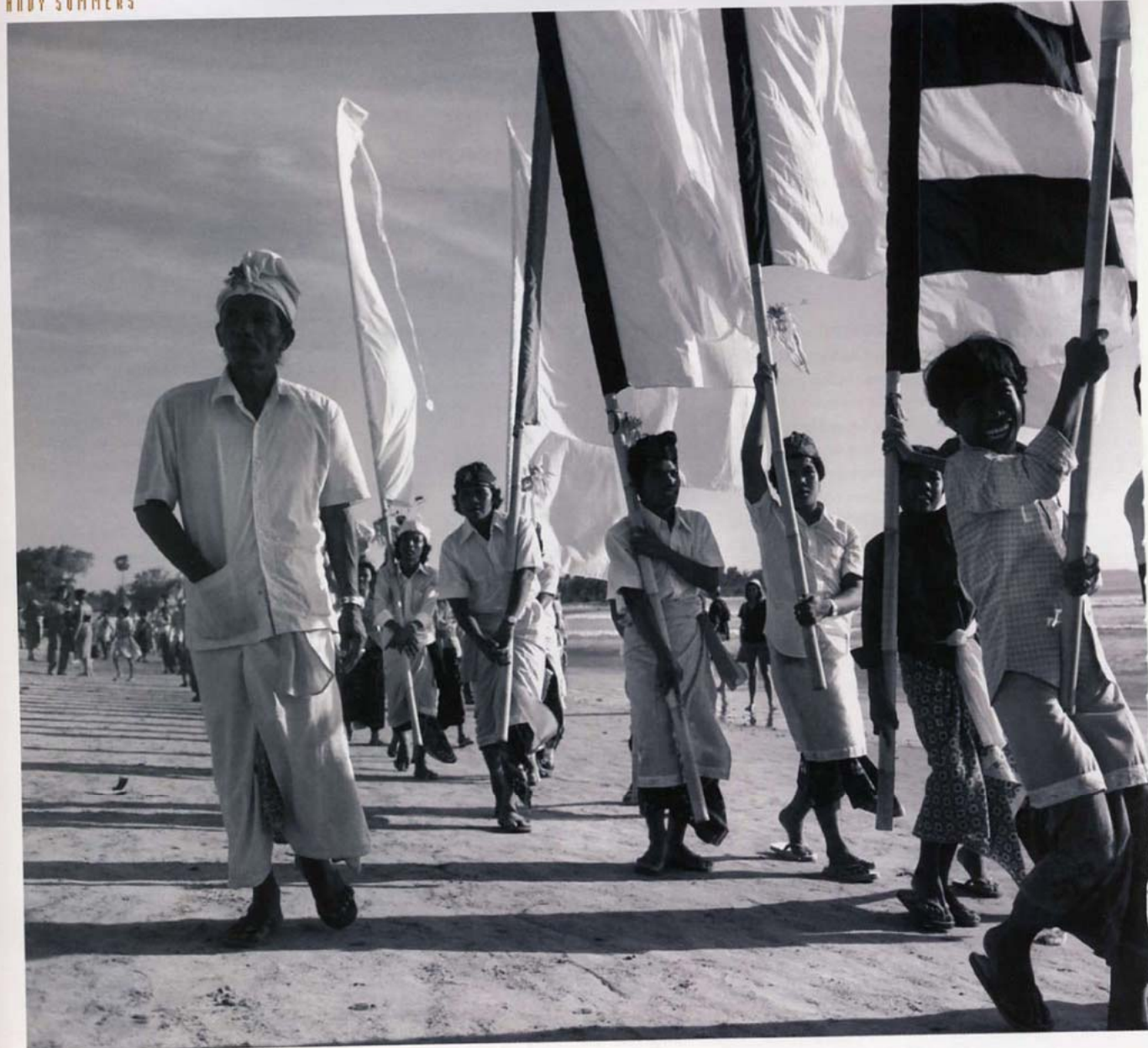
► Parade Bali 1981