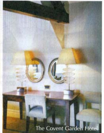
The Covent Garden Hotel