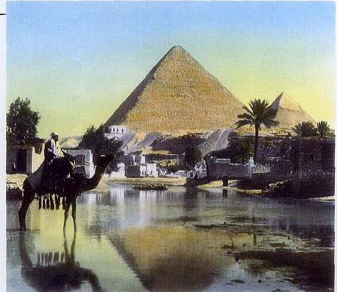
ABOVE Pyramids at Giza

Holmes coined the word 'travelogue' to convey to his audience that his photography was not simply educational, and that to merely look at his images of Paris, Peking, Delhi, Dubrovnik, Moscow, Manila, Jakarta, Jerusalem and so on, was to experience the world.