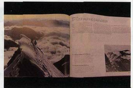
[Above] Images like this one of mountaineers climbing the Jungfrau in 1904 were practically impossible to capture at the time. Holmes broke all photographic boundaries