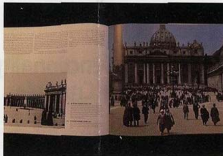
[Above] An archetypal shot of the Vatican Square in Rome, delicately hand-painted post-capture. A shot which has been caught a billion times over ever since