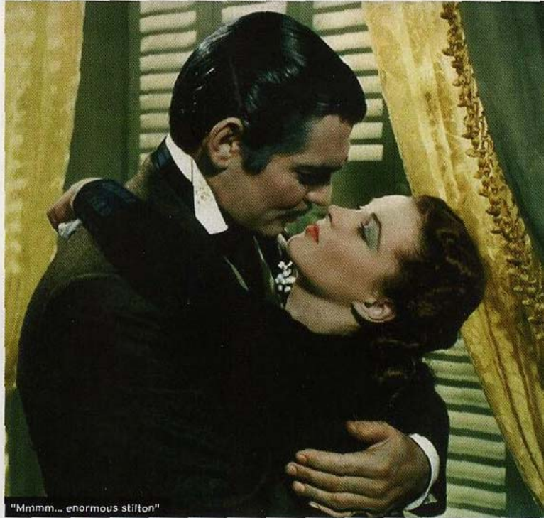
"Mmmm... enormous stilton"