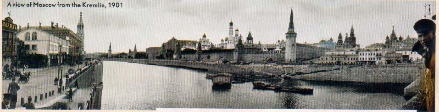
A view of Moscow from the Kremlin, 1901