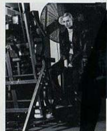
Text & image source : taschen.com