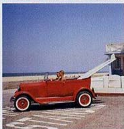
Clockwise from top left: Sunset Beach, Oahu 1968; San Onofre, 1963; Hermosa Beach 1963; Waime'i Bay 1973

It's 1969, the year of the Apollo moon landings and the Beatles' last public performance, and photographer LeRoy Grannis is on Sunset Beach in Oahu, Hawaii (above), doing what he likes best: shooting surfers. Californian-born Grannis, himself a seasoned surfer by his late teens, didn't pick up a camera until the age of 42 (his doctor advised him to take up a hobby after he was diagnosed with an ulcer), but his work quickly became sought after by surfing magazines and collectors. Now publishers Taschen are bringing out a collection of his extraordinary surfing work from the 1960s and 1970s, focused mainly on the beaches of California -