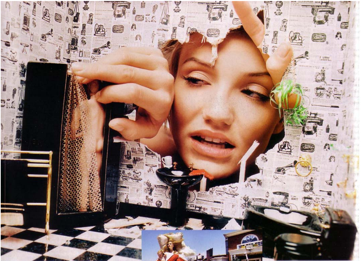
(Above) "Dollhouse Disaster, Home Invasion" (1997) and (right) "The House at the End of the World" (2005).