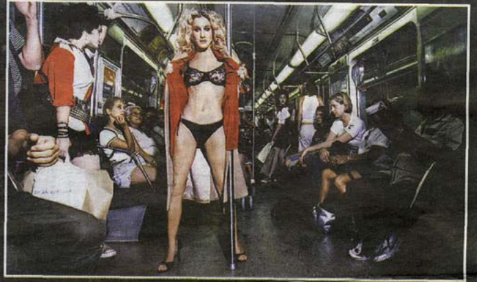
SARAH JESSICA: Sex was back in the city when SJP stripped down to her lacy black lingerie on the New York subway