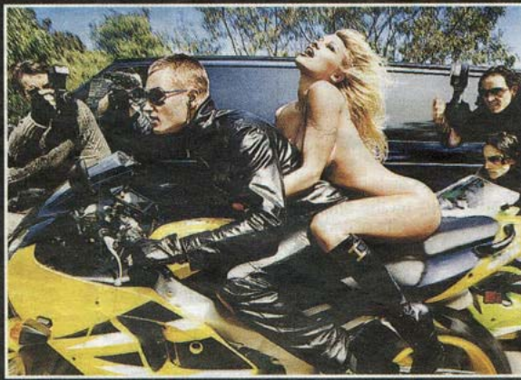
PAMMY: The Baywatch star is his favourite model... thanks to racy shots like this