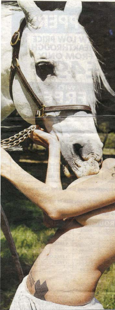
ANGELINA: Neddy gets a nuzzle as Ms Jolie frolics topless