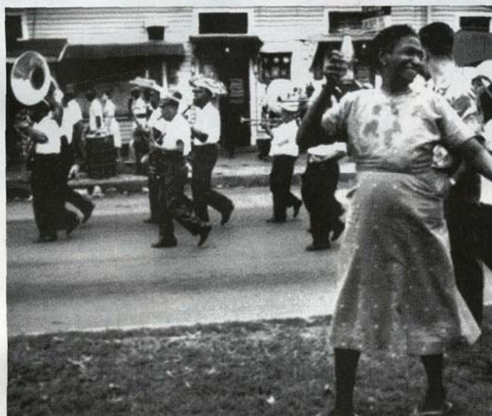
Top left: Max Roach, dancer and sunbather at Newport; bottom left: Miles in unguarded moment in Hollywood; this page: Stan Getz, Hollywood (top); funeral procession, New Orleans.

Now we can relive their journey, thanks to a handsome, large-format (it's half a metre high) reissue of Jazzlife , its original black and white images now joined by previously unpublished colour photographs. Portraits of jazz and blues legends (Muddy Waters, Dave Brubeck, Stan Getz, Billie Holiday, Ella Fitzgerald, Miles Davis, Charles Mingus, Thelonious Monk, John