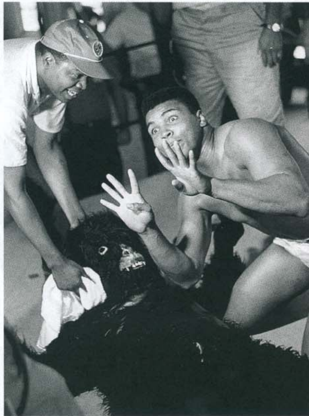
'THE BEAR WILL FALL IN EIGHT' Ali on 'big, ugly' Sonny Liston during this stunt before their fight in 1964.

The wink. It meant so much. Many observers questioned whether Sonny Liston took a dive in his second fight against Ali. The punch that supposedly knocked him out didn't seem to have much on it. 'I call it the anchor punch,' Ali said in response. 'People couldn't see it because it was so fast. Sports Illustrated got a slow-motion camera and clocked the punch in four one-hundredths of a second, which is an eye blink, like a camera flash. Now the minute I hit Sonny Liston, all those people watching the fight blinked at the same moment. That's why they didn't see the punch. So if you watch the film, when I say, "All right, I'm getting ready to hit him," you gotta hold your eyes [open] or you won't see it. I swear! No kidding!'