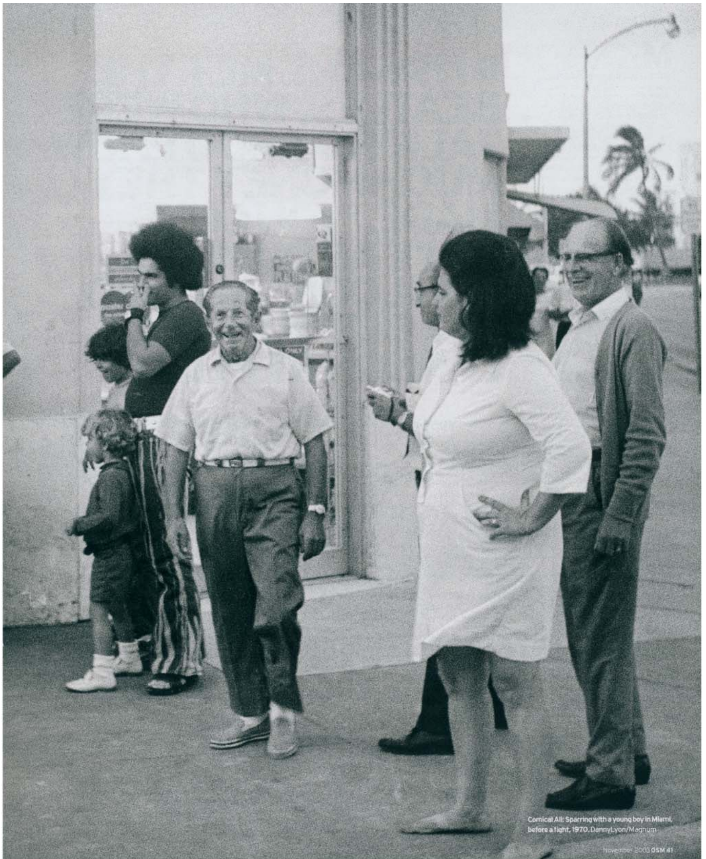
Comical! All: Sparring with a young boy in Miami, before a fight, 1970.